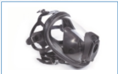
F2 Facemask P (EPDM) R54697 F2 Facemask P (Silicone) R54694