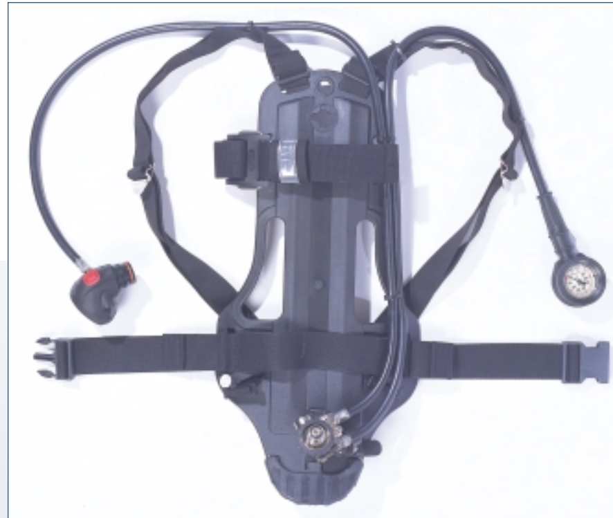
PA91 Plus Push in 5550685 PA91 Plus Push in (Italy) 5550685