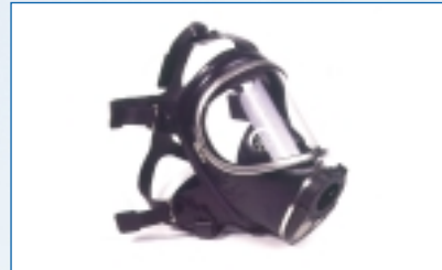
Panorama Nova Facemask P (EPDM) R52972 Panorama Nova Facemask PE M45 x 5 (EPDM) R51492 Panorama Nova Facemask P (Silicone) R55070 Panorama Nova Facemask Standard P (EPDM) R54550